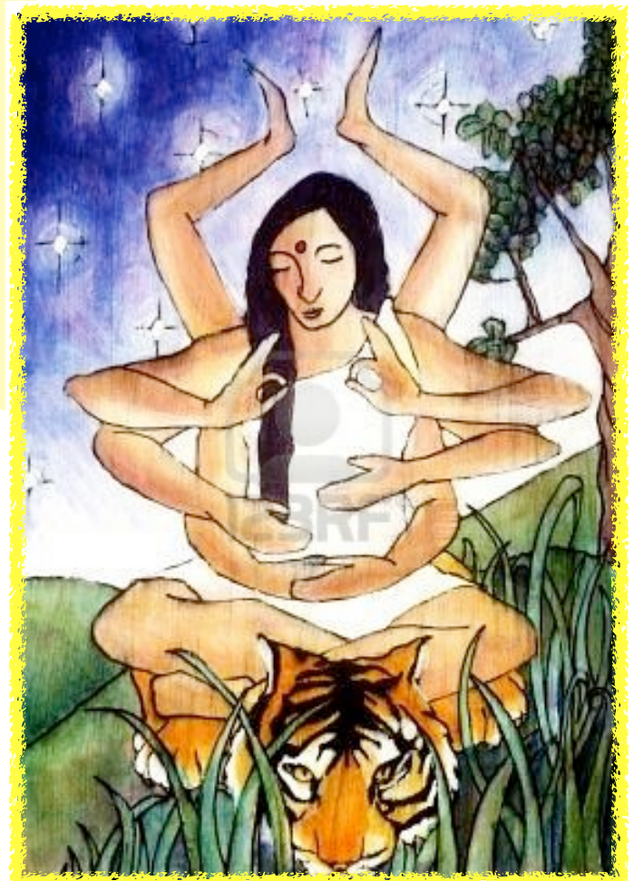
Hindu goddess Durga with 8 arms sits atop a tiger.